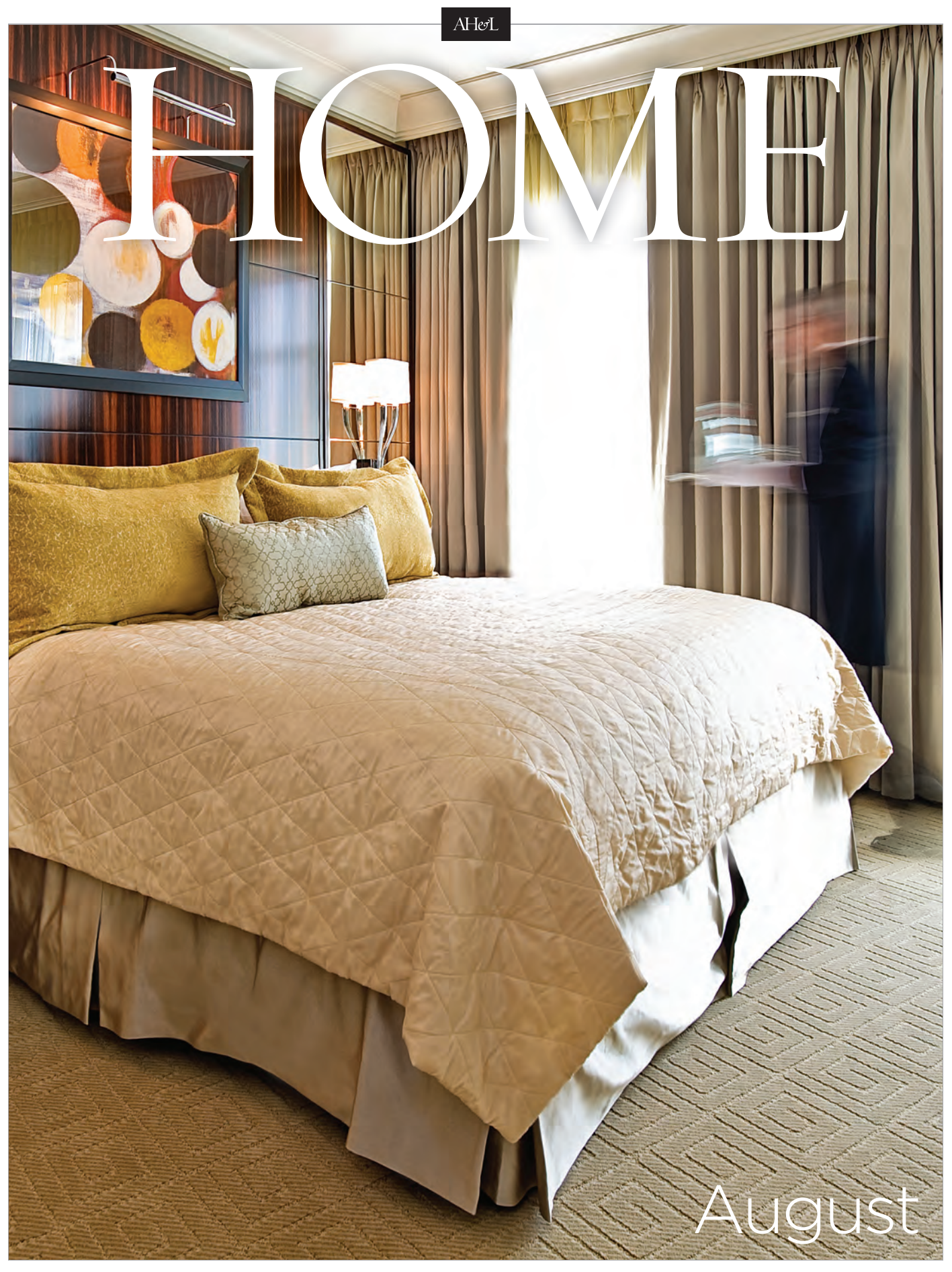
HOTEL AS HOME With expansive 9'6" ceiling heights, guest rooms at The Mansion on Peachtree feature furnishings with a high level of detail, including lush velvet and satin fabrics. Bathrooms feature marble-top vanities, dual washbasins, a deep-soak tub, walk-in marble shower and wall-mounted LCD TV.